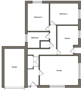
Floorplan is indicative of layout only and should not be used for accurate measurement or structural purposes.